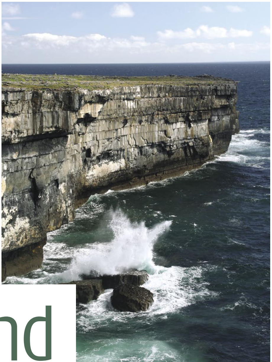
Windswept cliffs on the Aran Islands.