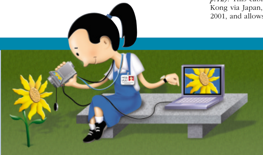
EMILIO RIVERA III

The key to HGC's ability to provide a full range of international bandwidth services is the East Asia Crossing submarine cable provided by Asia Global Crossing ( see sidebar, p.12 ). This cable, which stretches from the USA to Hong Kong via Japan, landed in Tseung Kwan O on January 10, 2001, and allows HGC to offer, in effect, a one-stop service